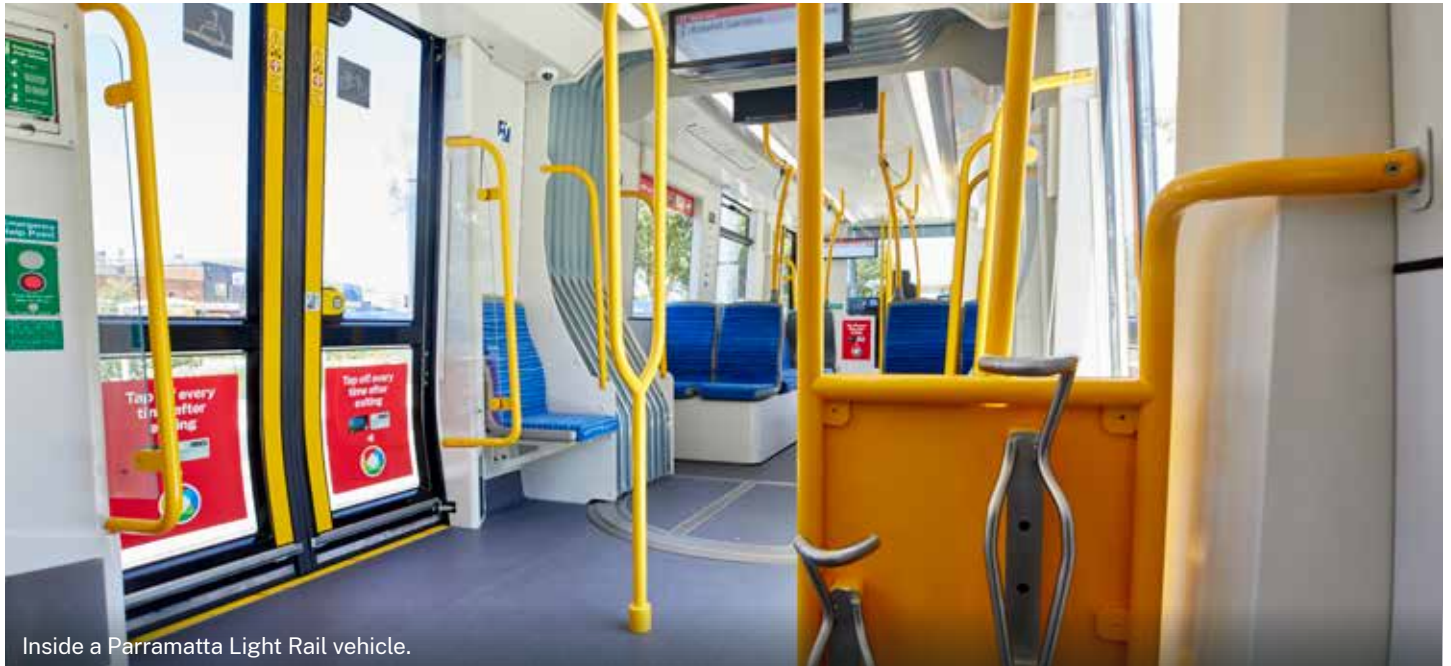
Inside a Parramatta Light Rail vehicle.