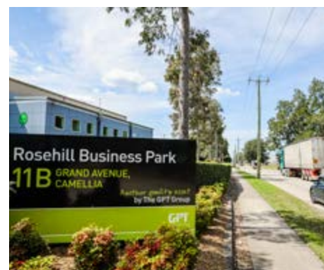
Rosehill Business Park.

A new light rail and active transport bridge over the Parramatta River between Camellia and Rydalmere will provide connectivity north and south of the river. An alternative bridge alignment option (Camellia foreshore to Rydalmere) is being investigated as part of the project.