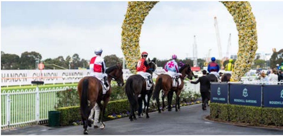
Image of Rosehill Gardens Racecourse.