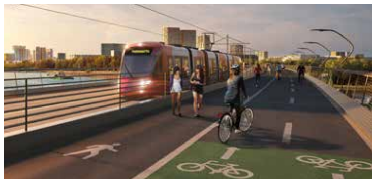
Artist's impression of the new bridge over Parramatta River connecting Wentworth Point and Melrose Park.

The procurement of a contractor to deliver the bridge between Melrose Park and Wentworth Point is underway.