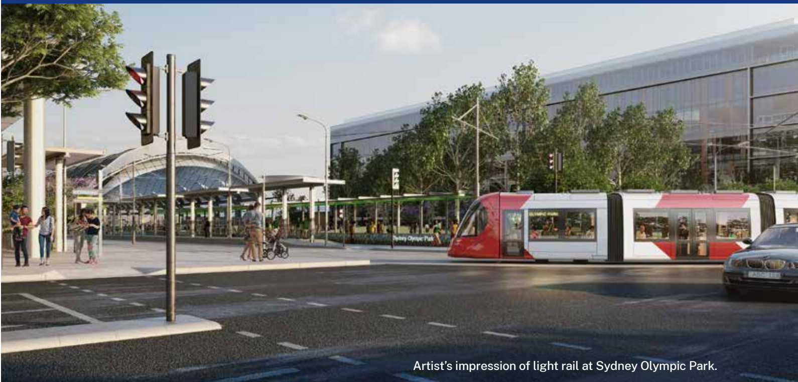
Artist's impression of light rail at Sydney Olympic Park.

Parramatta Light Rail Stage 2 is the NSW Government's latest public transport megaproject being delivered to serve a growing Western Sydney. Stage 2 will connect Stage 1 and Parramatta's CBD to Sydney Olympic Park via Camellia, Ermington, Melrose Park and Wentworth Point with a two-way track spanning 10 kilometres and 14 accessible stops.